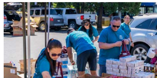
Keller Williams, Rick's Custom Fencing, the Impact NW Ambassador Board and community members unite to make and impact at Dancing Tree