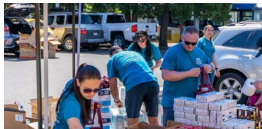
Keller Williams, Rick's Custom Fencing, the Impact NW Ambassador Board and community members unite to make and impact at Dancing Tree