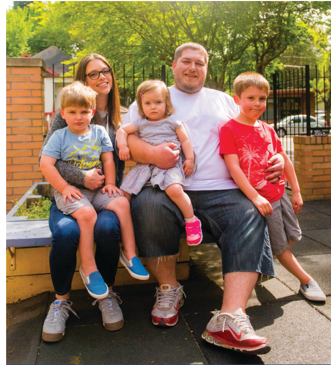
Impact NW clients from our Housing & Safety Net Program

Annually, we serve more than 30,000 low-income individuals and families throughout Multnomah, Clackamas, Washington & Clark Counties. Our programs span the fields of: housing support, career readiness support, education, recovery services, family support, and senior services.